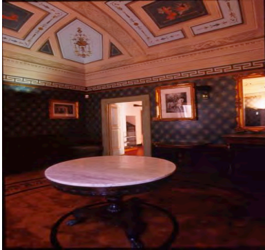
D'Annunzio's birthplace in Pescara

Many distinguished artists, poets, philosophers and musicians were born in Abruzzo, in a period of time ranging from Roman Empire to the present day, and they have marked our cultural heritage, leaving us their works of art and their thoughts. In addition to the best-known names of the Italian scene there are many people who have had less resonance in the national scope, but whose works attest to the greatness and the vast wealth of historical and artistic heritage of Abruzzo.