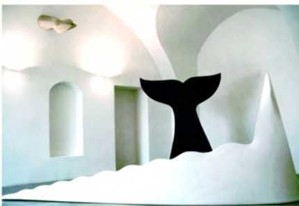
Grande rettile e coda di cetaceo large reptile and tail of the whale

A tangle of cobbled streets; terraces overlooking the cliff; small buildings even whiter than the blue which characterizes the Adriatic Sea on which they overlook. It was in Polignano a Mare, one of the most beautiful towns on the coast in the province of Bari, that the great artist Pino Pascali was born. He was born in 1935 and prematurely died in a motorcycle accident at age 33. In front of the house where he lived with his family, in the heart of the historical centre, even today, there is a plaque in his memory, and the Municipality wanted to give his name to a street. The homonym Museum Foundation is dedicated to him. It has been made in the former municipal slaughterhouse, a striking building overlooking the seafront promenade, masterfully restored and opened to the public in 2010. Here the artist and scholars interested in culture, in general, can immerse themselves in the Pino Pascali's story: theatre and television sets, bio-bibliographical archive, thesis study, posters, books, reviews, press reviews, photographs, films, original memorabilia. A single creative genius: Pascali conjugated primitive elements of the Mediterranean nature (sea, land, fields, farm tools) with infantile forms (animals and carnival characters). His "false sculptures" (false