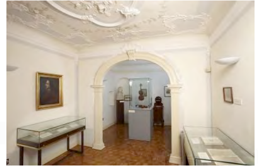
Giuseppe Tartini Memorial Room in the Tartini's Birth House in Piran

In spite of numerous monographs, professional articles and publications, and editions covering his musical corpus, a void still exists in the sphere of popular presentation of his work that would be intended for the widest public, which is in Piran stumbling upon Tartini or his memory at every single step: - after him, the central town place has been named – Tartini Square; - since 1896, the composer's monumental figure, done by the famous venetian sculptor Antonio Dal Zotto, rises from the middle of the square; - the house of his birth, which was exemplarily renovated during 1984-1992, with a memorial plate installed, is proudly looking at the square, port and open sea; - in the memorial room of his birth house in Tartini Square, some very valuable parts of his legacy are exhibited: Nicolò Amati's violin, printer for drawing staves, portraits, manuscripts and scientific works, furniture from the former Tartini Villa in Strunjan etc.