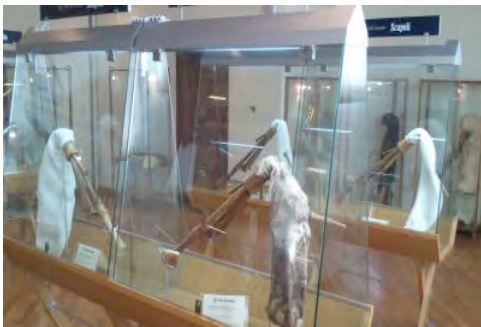
Museum of the Bagpipe - Scapoli

Inserted in the heart of lung green of Molise, where do you can get lost between outstanding natural landscapes and numerous city of art is located Scapoli, medieval village dating from IX century, rich in story and culture. It is one of few countries in Italy, where together with the presence of skilled and talented musicians, survived the ancient tradition of the factory of bagpipes, thanks to a small number of craftsmen that, construction techniques handed down, keep it alive this musical instrument and ensure the necessary generational change. Every year since 1975, in the last week-end of July there is in the country the traditional “International Festival of bagpipes”, an event that attract thousands of people from all over the world.