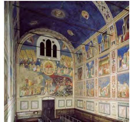
Padova, Scrovegni Chapel, Giotto

Many distinguished artists, poets, philosophers and musicians were born in Abruzzo, in a period of time ranging from Roman Empire to the present day, and they have marked our cultural heritage, leaving us their works of art and their thoughts. In addition to the best-known names of the Italian scene there are many people who have had less resonance in the national scope, but whose works attest to the greatness and the vast wealth of historical and artistic heritage of Abruzzo. So there are many places that testify their lives and works of art, like squares, monuments, "house-museum", foundations; among them the "house-museum" of Gabriele D'Annunzio, the "bard" of the Italian Decadentism, in Pescara; the so called "Cenacolo Michetti" and the MuMi (Museum Michetti that thanks to the Michetti Foundation has established a National Painting Prize since 1947) in Francavilla al Mare (CH) devoted to the artist Francesco Paolo Michetti; the "villula" Fiorinvalle di Terra d'Oro in Sant'Eusanio del Sangro (CH), a house museum of the poet Cesare De Titta; the Museum Cascella in Ortona (Ch) which hosts a lot of paintings of the Cascella's family; the birth house of Gabriele Rossetti in Vasto (CH) where, besides a research center, there is also the " Fondo Rossetti " including several works and letters, and the " Lascito Spataro ", 68 publications of the XVIII century.