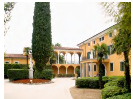
Palace Coronini Cronberg - External view