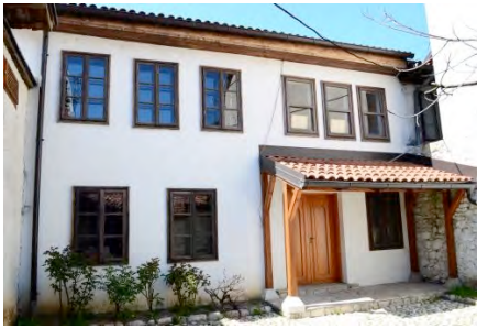
House of Zuko Džumhur