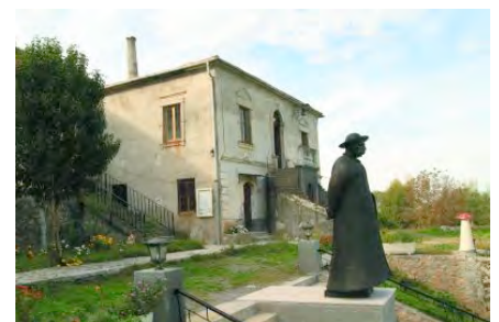
The museum house of Ndre Mjeda in Kukel

The best kept artist's house is the House of Ndre Mjeda in Kukel, which has been reconstructed and open to visitors in the recent years. The name of Mjeda is well known in the Albanian speaking area as a philosopher, priest, researcher but mostly as a lyrical poet. He lived most of his life and wrote most of his works in this house halfway between Shkodra and Lezha, at the place named Kukel. Mjeda, in difference from most of his colleagues was not prohibited during communism and his house served as a museum where were kept most of his works. The house was built in 1907, in a neoclassic style, designed by Mjeda himself. In 1913 adjacent to the house was built the parish church of Kukel where Mjeda served as a priest. In the years '90 the house was forgotten and lost his grace but with a recent reconstruction of the house and its historical elements, it is back to its beauty and open to visitors.