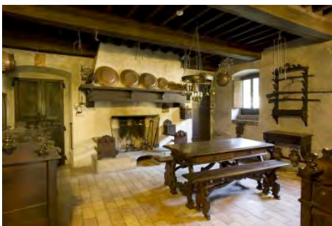
The Kitchen with original furniture - Il Cardello - Casola Valsenio

The Romagna region is the birthplace of famous writers and has hosted several of them. Walking in the historical center of Ravenna, you can retrace the places related to the stays of two distinguished exiled writers : Dante Alighieri and George Byron. In the case of "the Supreme Poet " also the pine forests have inspired a number of paradisiacal landscapes described in the Divine Comedy. Cervia was the summer retreat of Grazia Deledda and going through the streets of its typical square-shaped city center you can find the places where "the little man of the drop of tin" lived.